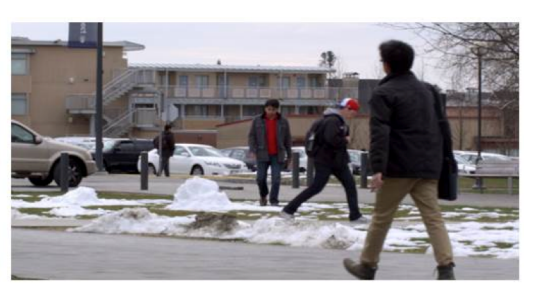
b) Video2, WalkingonSnow