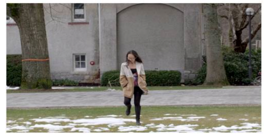
a) Video1, WalkingGirl

We chose four representative sequences from the DML-HDR dataset for our experiments. Table I illustrates the specifications of the sequences. A snapshot of the videos is provided in Fig. 1. Note that in Fig. 1, the original HDR frames are tone-mapped to a LDR representation using the adaptive logarithmic mapping [16] for demonstration purposes. The captured videos are originally stored in ".hdr" floating point format and in linear RGB space. However, since the only accepted video format supported by the HEVC and H.264/AVC video encoders is ".yuv" raw files, the videos were converted to 12 bit "4:2:0" raw format using the ITU-R Rec. BT.709 color conversion primaries [17]. To this end, the RGB values are first normalized to [0, 1]. Then, these values are converted to YCbCr color space in accordance to ITU-R Rec. BT.709 [17]. Next, using the separable filter values provided by [18], chroma-subsampling is applied to the YCbCr values to linearly quantize the resulted signals to the desired bit depth