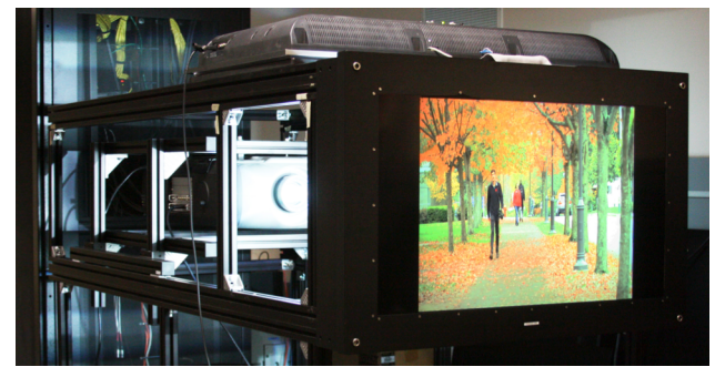
Fig. 2. Illustration of the prototype HDR display system

Test session settings are according to ITU-R BT.500 [24]. In each session, a maximum of three subjects participated. Presentation of the test materials is based on the Double Stimulus method, where the original version of the test video is followed by a 3 second gray interval, and the compressed video streams are presented to the viewer. The gray interval is used in order to allow viewers to rest their eyes. After showing the original and compressed videos, a 4-second gray interval is